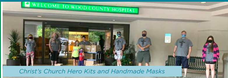
Christ's Church Hero Kits and Handmade Masks