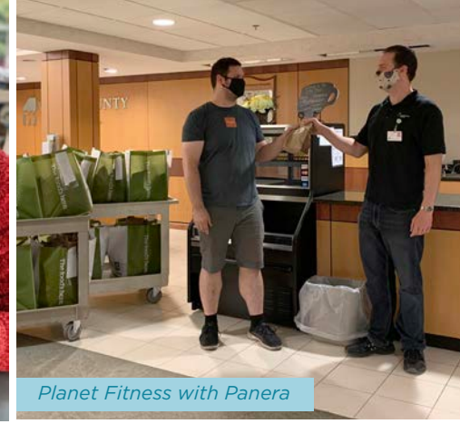
Planet Fitness with Panera