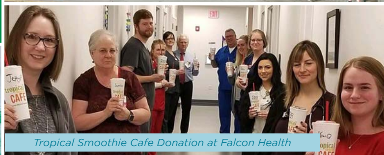
Tropical Smoothie Cafe Donation at Falcon Health