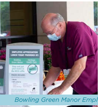
Bowling Green Manor Employee Cookout